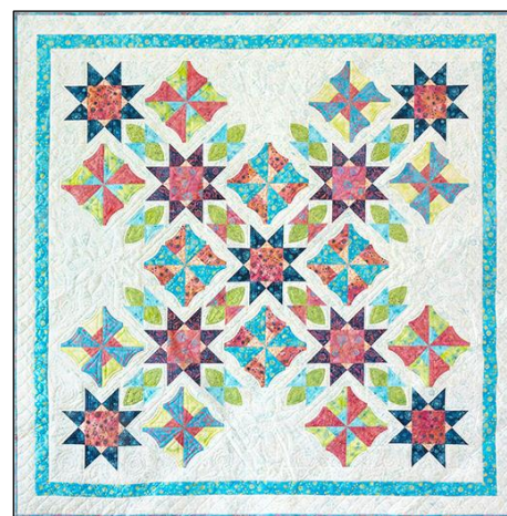
Quilt Size: 74" x 74"