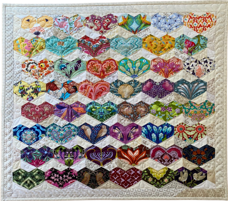
Finished size 24" X 22"