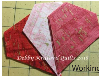
Working with jewels