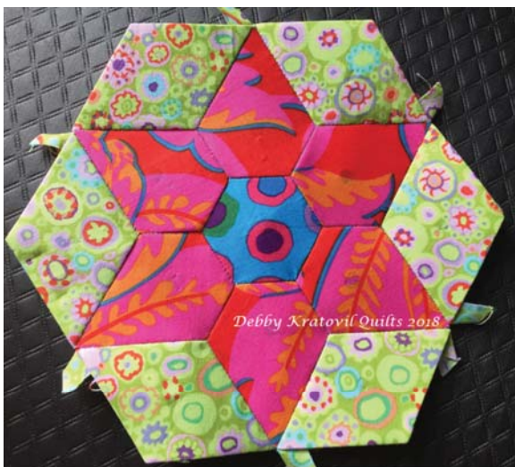
Star Bouquet: Hexagon, Diamonds & Jewels