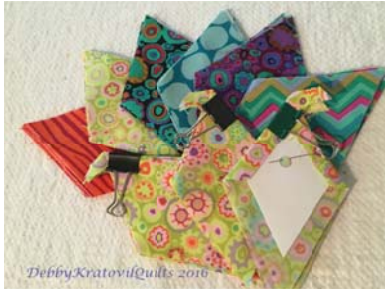
Working with diamonds

We begin with simple hexagons and branch out to include even more shapes: diamonds, jewels, and even pentagons. The possibilities are endless and we will discover how we can mix and match the blocks and use them in projects – from mug rugs to table runners to small quilts.