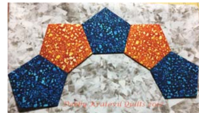
Working with pentagons

My Pentagon Wreath appeared in Quiltmaker's 100 Blocks, 2017